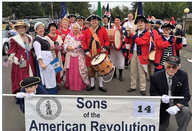
SAD/DAR Combined Color Guard in the Black Diamond Parade