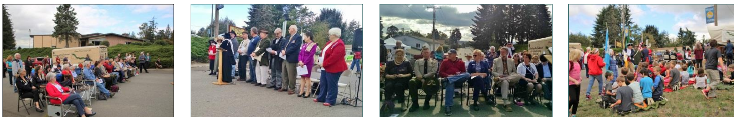
Approximately 200 people were in attendance, including local citizens, representatives from historical groups, elected officials, local government staff, and the entire 4 th grade class of Toledo Elementary School.