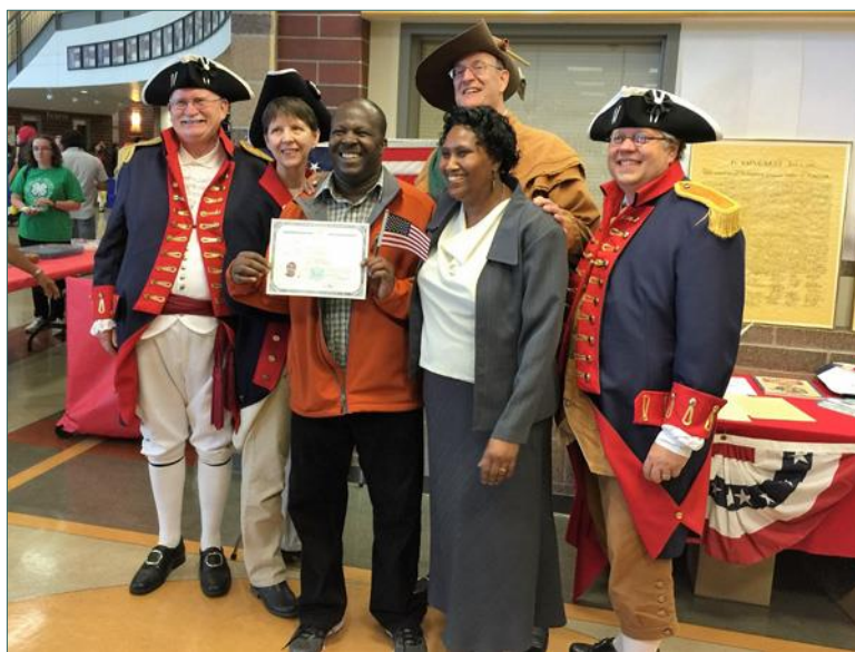
WASSAR and DAR Color Guard members pose with new one of many new citizens at the Tacoma Tahoma High School citizenship event

We have done this for the last five years with great success and much praise from the auditor and her staff. She has been especially supportive of our SAR Color Guard, wanting us at every ceremony and