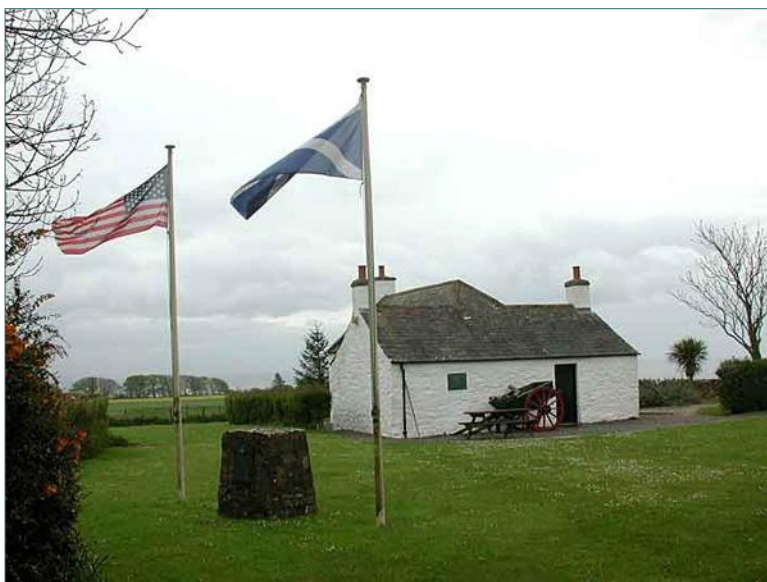
The John Paul Jones Cottage Museum in Dumfries, Scotland