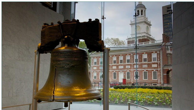
The "Bronze Patriot" in Philadelphia, PA

The bronze patriot of American history rests at Independence Hall at Philadelphia, where both the Declaration of Independence and Constitution were first proclaimed. The Liberty Bell, with its beam of hand-hewn black walnut and great stilled tongue, is the very symbol of our Country. The proud letters around its crown, “ Proclaim Liberty Throughout All the Land Unto All the Inhabitants Thereof, ” is a Biblical reference from the Book of Leviticus (25:10), the words selected in the year 1751. Isaac Norris, Speaker of the Assembly of the Colony of Pennsylvania and a passionate patriot, was chairman of a committee to purchase a bell from England. The order was placed with Lister, the most prominent bell founder of that era, for an instrument of some 200-pounds.