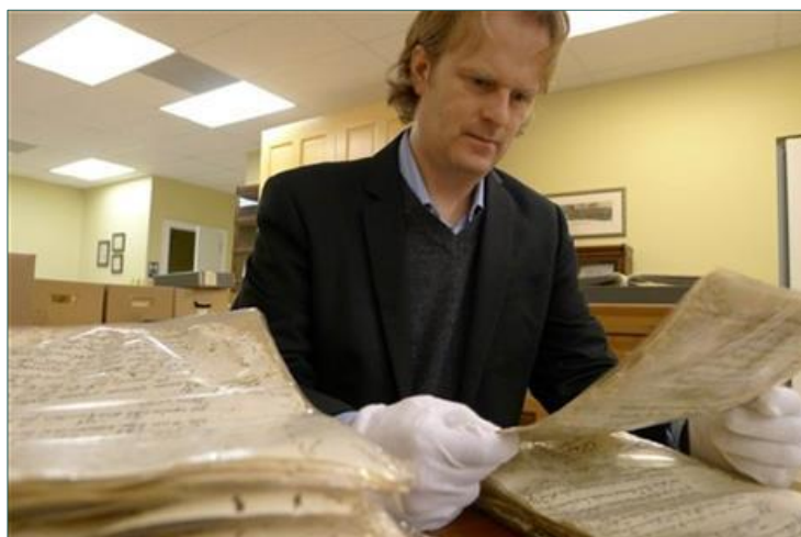
Preserving Historical Documents

Digitization of records is a major initiative of the National Society. With over 2.2 million paper records, it has become apparent that electronic copies complete with indexing are a must for our society. Done properly, digitization and indexing of our applications and proof documents could allow for the creation of a functional Genealogical Research System (GRS). Digitization would also provide an electronic backup system for our paper