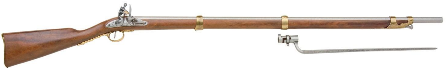
Charleville AN IX flintlock musket and Bayonet