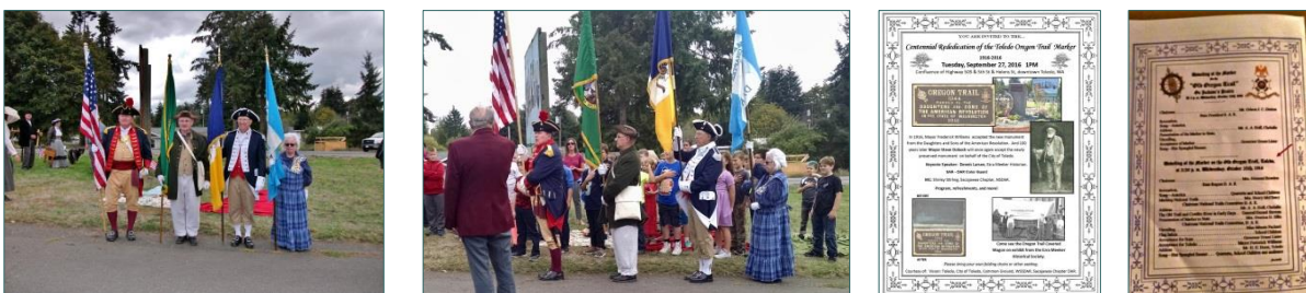
WASSAR and DAR Color Guard started the event with elegance and vigor. The program was patterned after the original 1916 program and that actual program was included in the leaflet distributed

On Tuesday September 27, 2016 a 100 th Birthday, Re-dedication and Unveiling Ceremony was held at the marker in Toledo, WA and sponsored by local community groups. A city street was blocked off for the event.