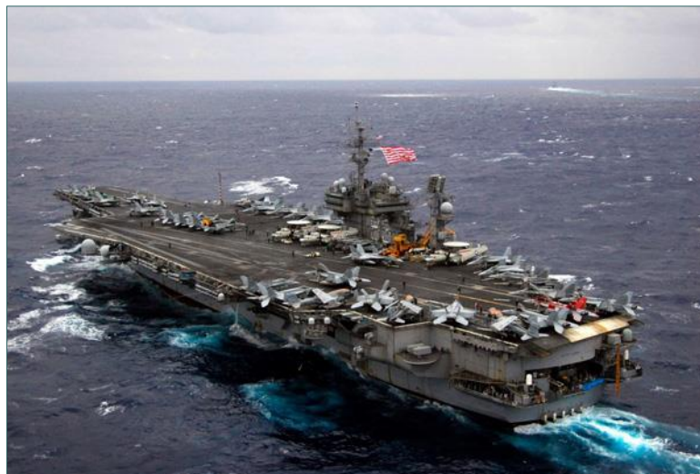
USS Kitty Hawk (CV 63) flying the distinctive "Don't Tread on Me" Jack