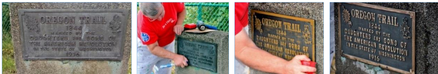
Before and after of the smaller plaques starting at Tumwater