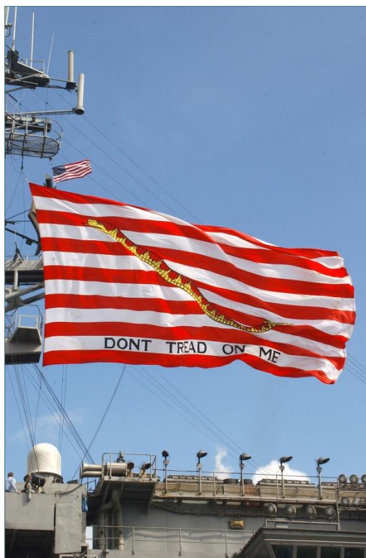
The U.S. Navy Jack

In the fall of 1775, as the first ships of the Continental Navy readied in the Delaware River, Commodore Esek Hopkins issued a set of fleet signals. Among these signals was an instruction directing his vessels to fly a striped Jack and Ensign at their proper places. The custom of the jack-type flag had originated with the Royal Navy in the 15th century or earlier; such was the likely source of Hopkins’ inspiration. This first U.S. Navy Jack has traditionally been shown as consisting of 13 horizontal alternating red and white stripes with a superimposed rattlesnake and the motto “Don’t Tread on Me.” The rattlesnake had long been a symbol of resistance to British repressive acts in Colonial America; its display on the new jack of the fledging Continental Navy fit naturally with the fervor of the times.