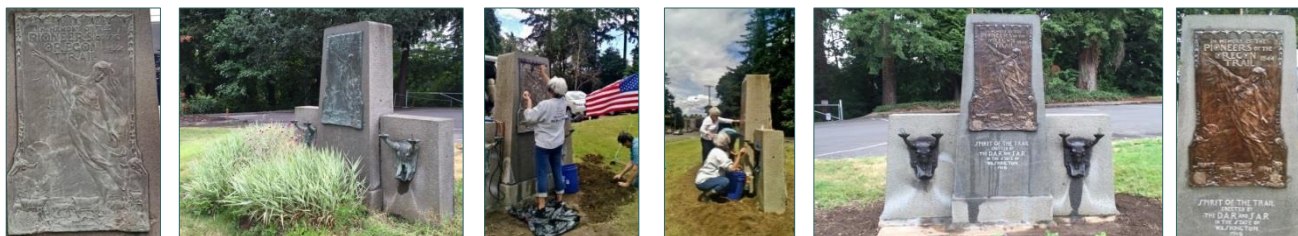
Before and after of the marker at Vancouver