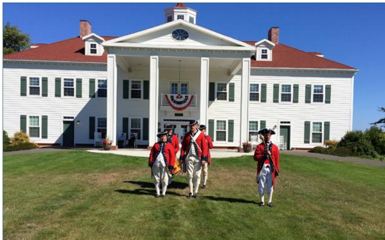
Fife & Drums of the "Army of the Columbia" provided signals

NW COLONIAL FESTIVAL - Aug 11-14 - Mount Vernon Plantation, Sequim, Washington Territorie!